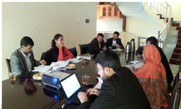
Officials of UN Women and ORCD discussing the rolling out project in ORCD