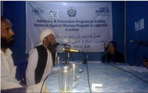
During a round table discussion from a local radio in Laghman Province