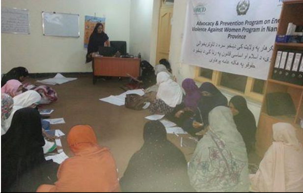
A session of women trained on their rights in Nangarhar Province