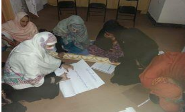
A group work during a training for women on their rights, Nangarhar Province