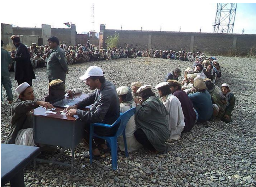
ORCD Field Distribution staff managing distribution of food and non-food items to refugees in Barmal

As an immediate response, ORCD in partnership with UNHCR started distributing tents and other basic relief items to the most vulnerable, in coordination with the World Food Programme (WFP) which supported ORCD in providing food commodities to be distributed to these refugees on monthly basis. These food commodities included sugar, rice, tea, beans and salt.