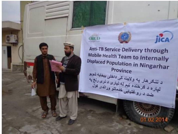
House to house visit by the medical officer of mobile health team in Nangarhar

This project was actually a continuation of the JICA efforts that it initiated in 2012 in the seven IDP camps in Nangarhar Province where approximately 70,000 internally displaced population are settled. The project started in May 2013 with initially set duration of 11 months. However, based on the satisfactory performance of ORCD, JICA extended it until the end of December 2014.