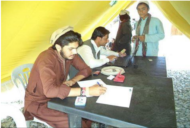
ORCD dedicated field monitors during beneficiary verification in the field

Faced with difficulties in transportation and a lack of relief coordination from the local authorities, thousands of families have opted to leave for bordering provinces in Afghanistan. In 2014, approximately 10,000 families were registered as refugees in Paktika province.