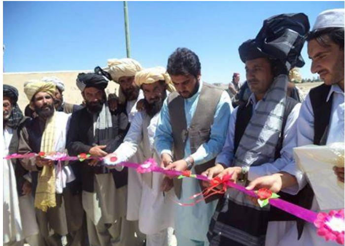
District Governor & community elders in one of the districts is cutting ribbon for inaugurating the project

Funded by the United Nations World Food Program (WFP), the objective of this project was to alleviate food insecurity in Paktika province as well as to improve the resilience of target communities toward drought and floods in this province. The project was also aimed at provision of food items to the refugees from North Waziristan who fled their homeland and settled in Barmal district of Paktika province.