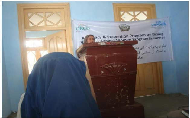
Kunar Director of Women Affairs delivering speech during a gathering in Kunar province