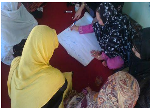
Women in Laghman during a group work of a training conducted by ORCD trainers