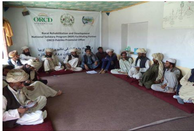
Community mobilizers of ORCD have joint consultation meetings with CDC members

In 2014, ORCD continued facilitating the National Solidarity Program in Paktika Provinc. Initially, ORCD was contracted by the Ministry of Rural Rehabilitation and Development (MRRD) for this project after a competitive bidding process to implement this project in Janikhail and Dila District and to assist communities to establish at least 75 Community Development Councils (CDCs). While ORCD and the target communities were able to initiate this program in Janikhail, this was not seemingly easy in the later district due to extreme insecurity. The fact that the success of the project substantially rely on the participation of target communities, the program could not be started in 2013 and 2014.