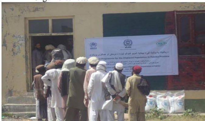
Refugees from North Waziristan in ques receiving food items from the distribution point in Barmal

The Department of Refugees and Repatriation (DoRR) in Paktika Province expressed their highest satisfaction about the activities of ORCD activities in this province for the refugees and displaced population in Barmal, Urgan and other districts. Please find attached the appreciation letter ORCD has received from DoRR in Paktika Province.